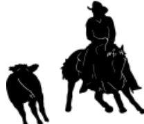
CUTTING HORSE2! =